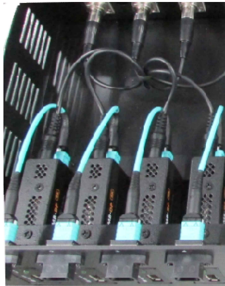
< 19RM-003 MPO/MTP Type >

7. Connect two(2) AC plugs to inlet of 19RM Series.