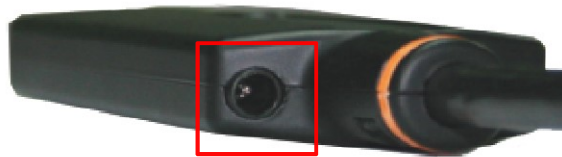
DC +5V Power jack

NOTE: The Transmitter and the Receiver modules must be connected to the included power supplies for proper operation. Transmitter module must be powered on first.